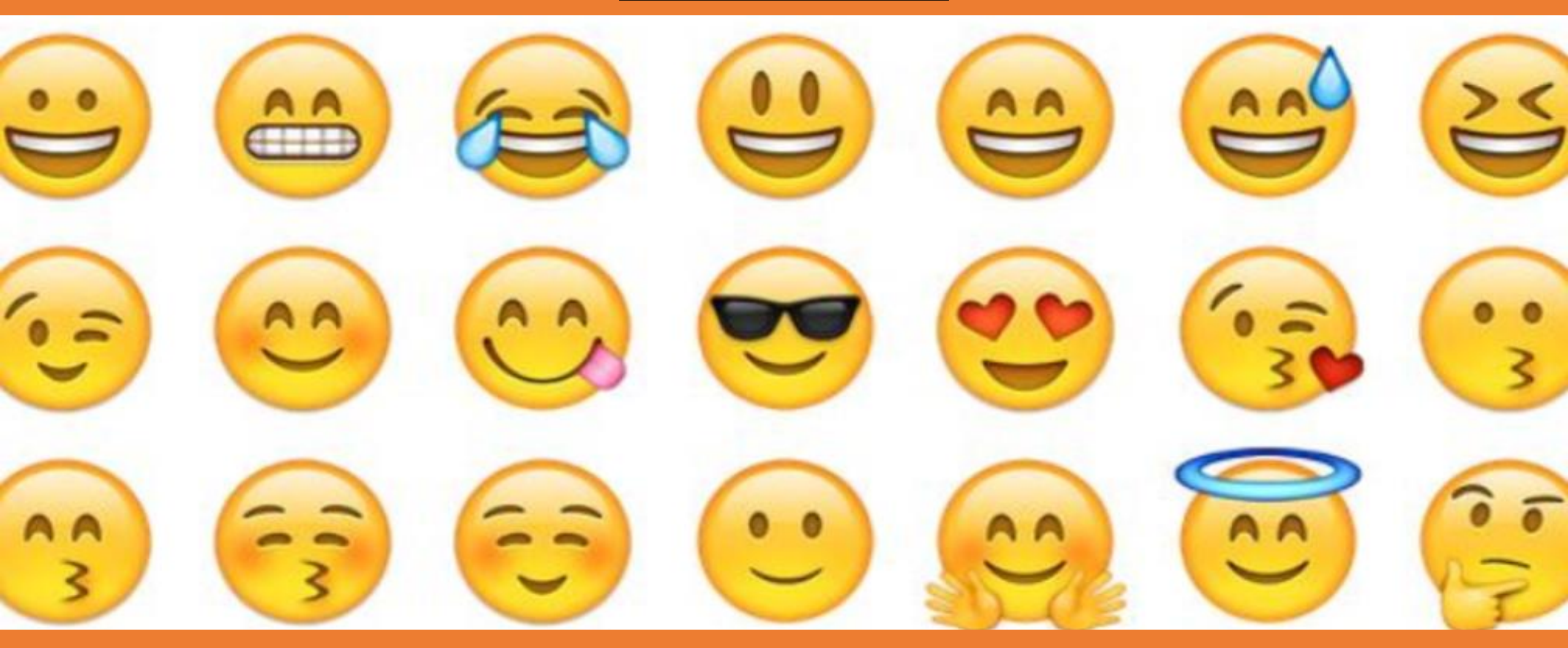
How do you feel about A Level English Language?