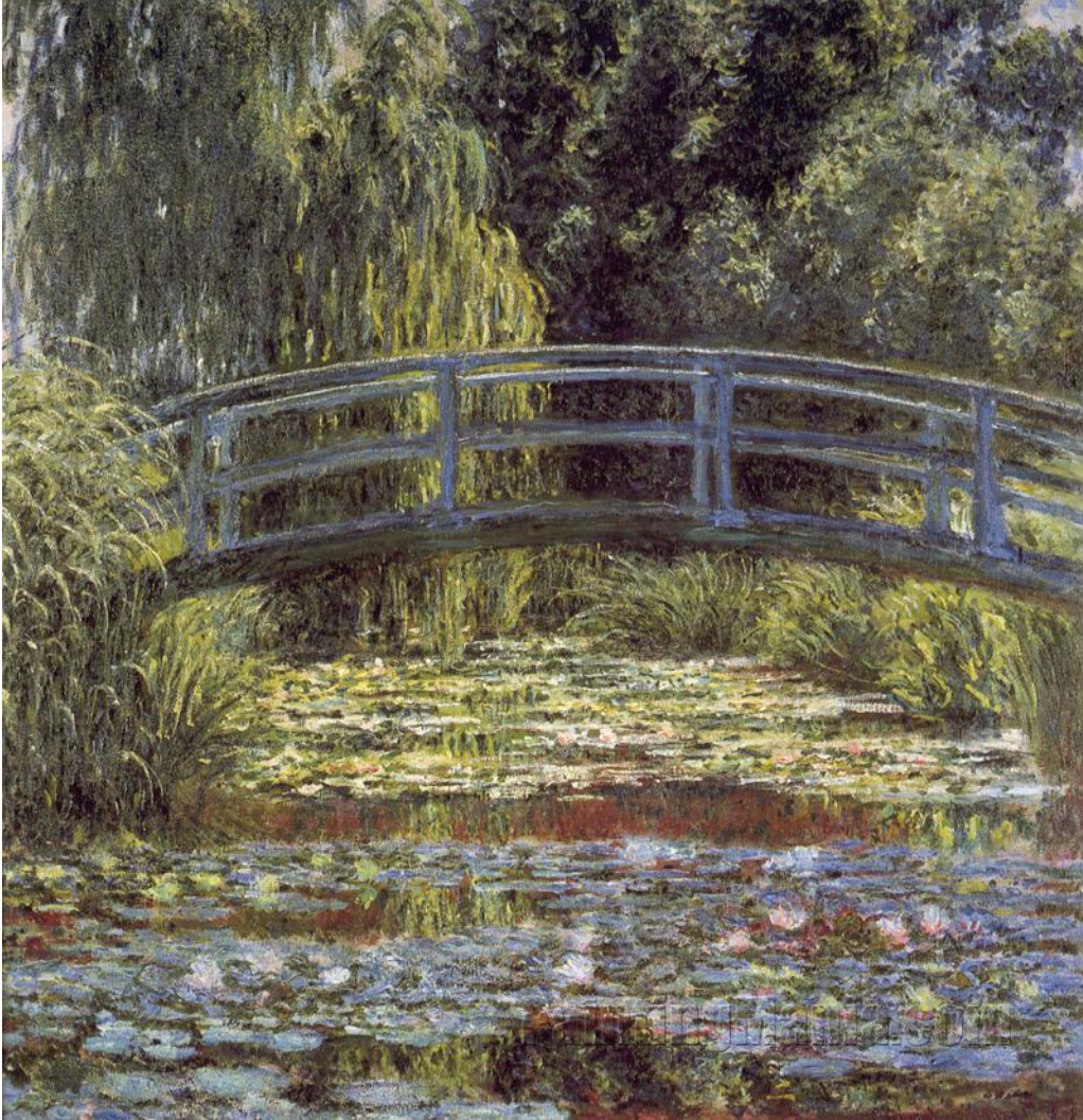
The Water Lily Pond (Japanese Bridge) Claude Monet 1899