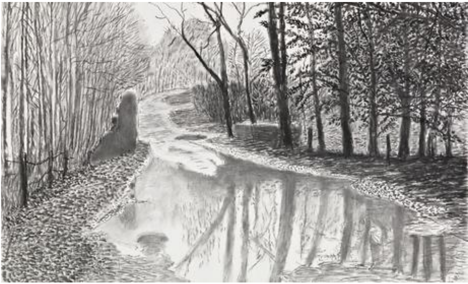
David Hockney Detail from Woldgate , 30 April, 1 & 5 May, 2013