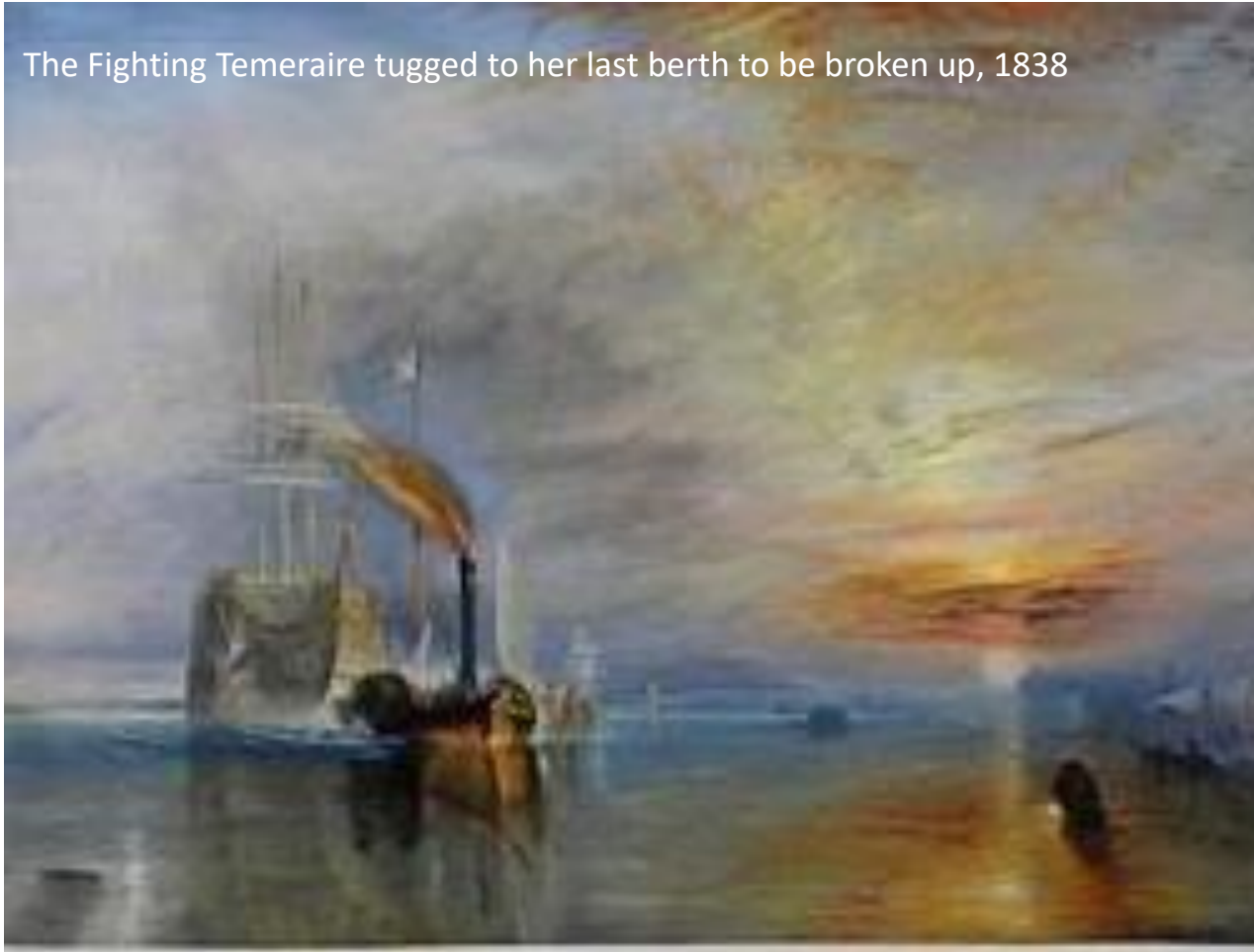
The Fighting Temeraire tugged to her last berth to be broken up, 1838

https://www.nationalgallery.org.uk/paintings/joseph-mallord-william-turner-the-fighting-temeraire