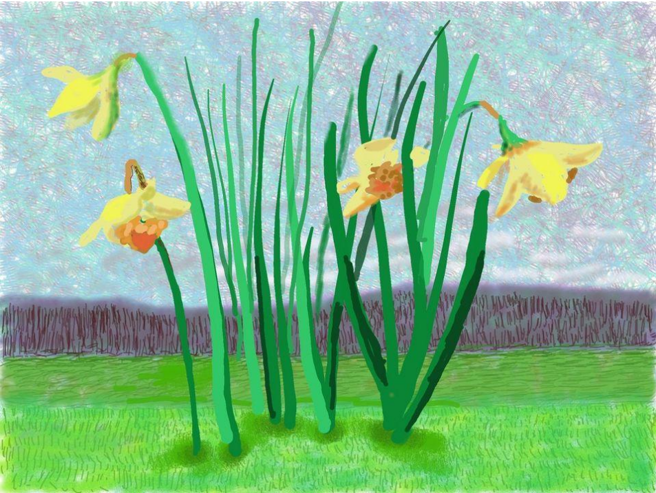
Springtime 2020: Hockney shared his new picture from Normandy in lockdown

“Do remember they can’t cancel the spring”.