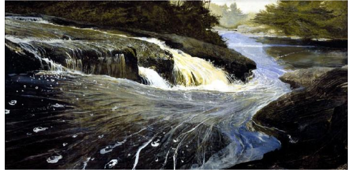
The Carry, 2003 tempera

https://www.bing.com/videos/search?q=andrew+wyeth+christina%27s+world+moma&&view=detail&mid=7AC8C7B379B1CAD68AD27AC8C7B379B1CAD68AD2&&FORM=VRDGAR&ru=%2Fvideo%2Fsearch%3Fq%3Dandrew%2Bwyeth%2Bchristina%2527s%2Bworld%2Bmoma%26FOR%3DHDRSC3