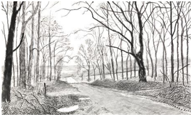
David Hockney Detail from Woldgate, 6 - 7 February, 2013