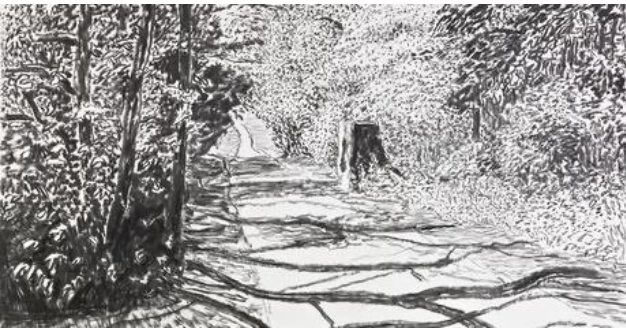
Detail from Woldgate , 26 May 2013