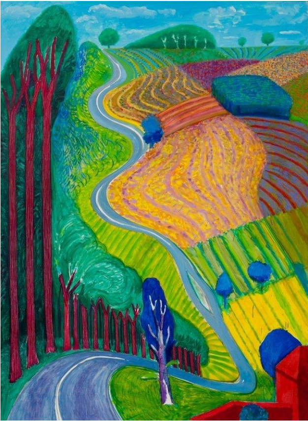
David Hockney Going Up Garrowby Hill 2000 painted in Yorkshire Private Collection

David Hockney born in Bradford in 1937 is one of the most important painters of the 20th century.